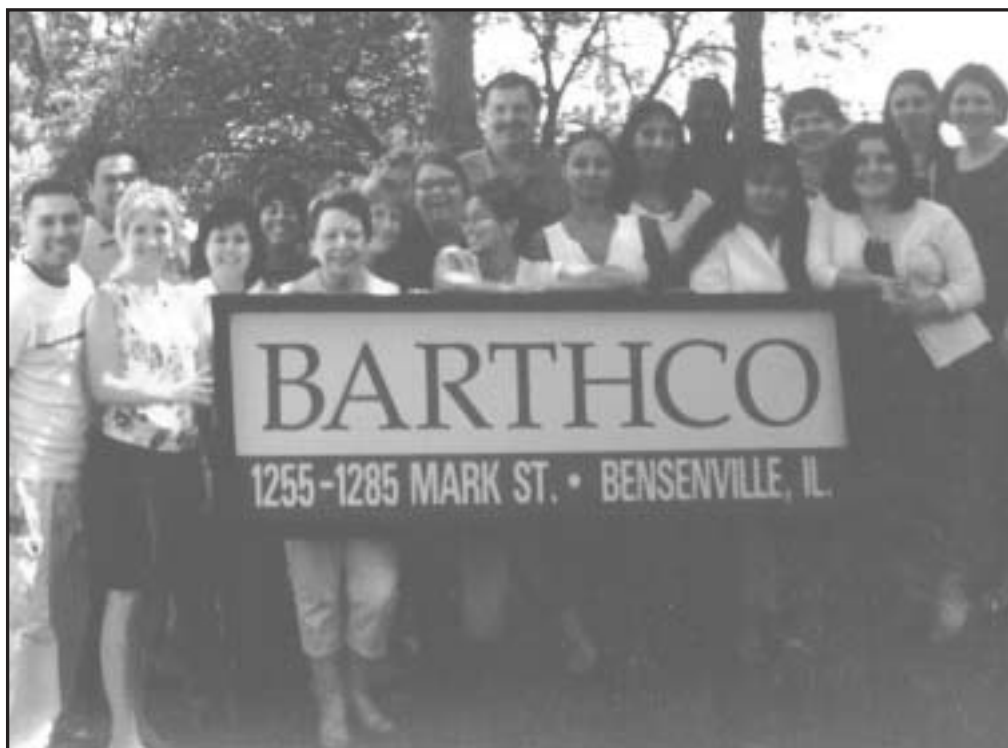
BARTHCO's Chicago team